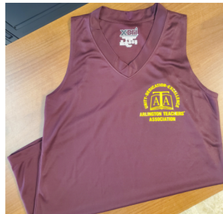
Dri Fit Workout Tank