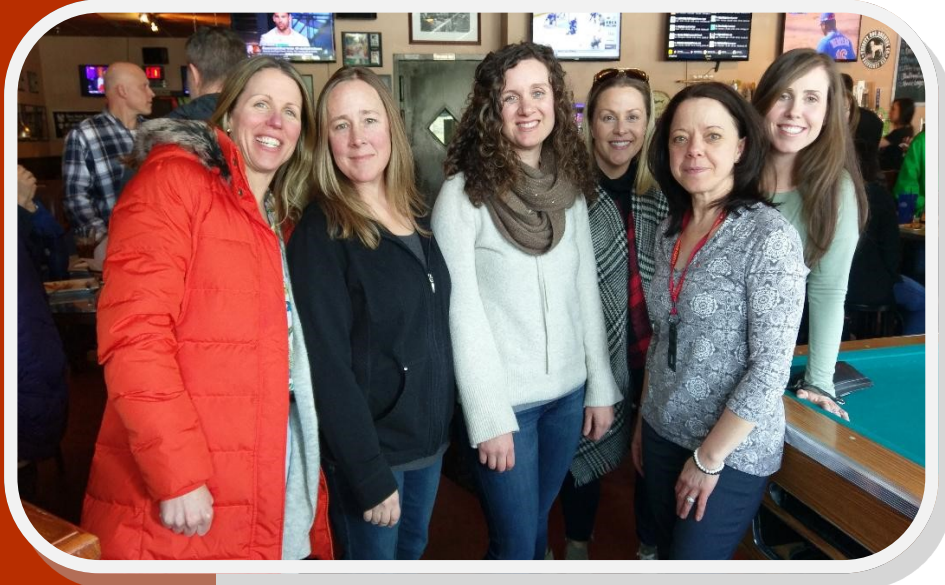
The ATA held a Unity Pub on Friday, March 8 at All City Grill in LaGrange. Many members from all schools made their way to the restaurant after school to enjoy the camaraderie of their colleagues and some great food.