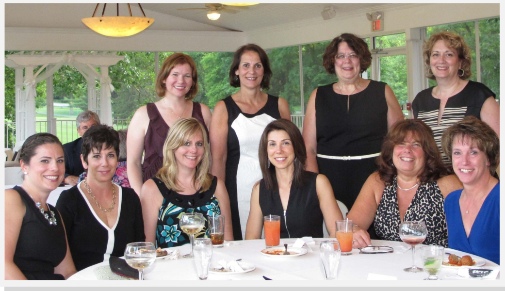
Traver Road's Recognition Dinner attendees

It has been an honor and privilege to be part of the Arlington community.