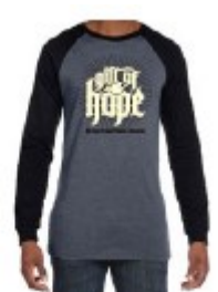
Canvas brand Raglan Fashion Long Sleeve