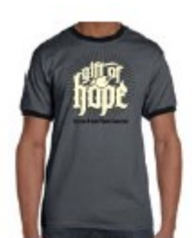
Canvas brand Premium Men's ringer tee