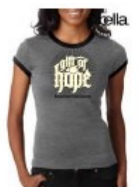
Bella brand Premium women's ringer tee