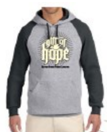
Jerzee 2-Tone Hooded Sweatshirt