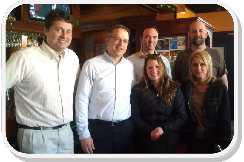
Vail Farm Elementary

The ATA held a Unity Pub event of the year on Friday, March 14 at Rambler's Rest in Beekman. Many members from all schools made their way to the restaurant after school to enjoy the camaraderie of their colleagues and some great food.