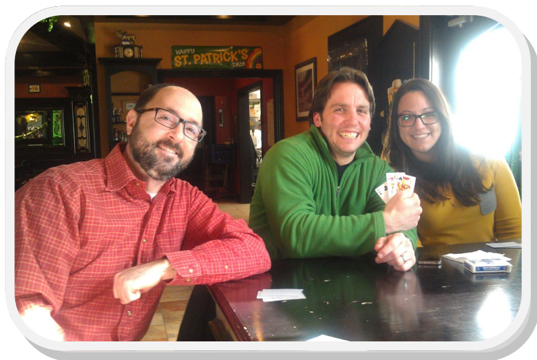
LaGrange and Union Vale Middle Schools