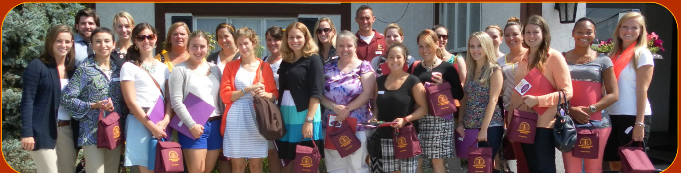
ATA New Teacher Luncheon - August 30, 2013