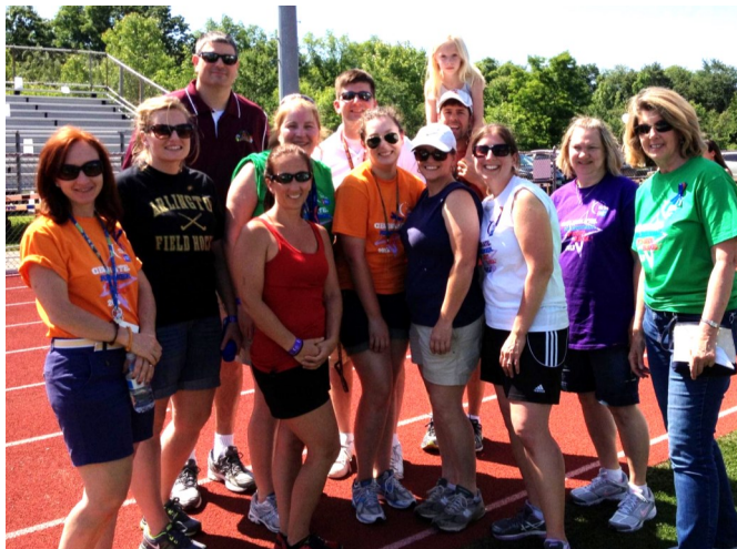
Many AHS faculty members helped to make the day a success at the Relay for Life event on June 15. The day's activities included teams walking around the track to raise money for cancer research and also many booths with activities for children.