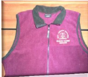
Fleece Vest (front)