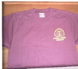
Short-Sleeved T-shirt (front)