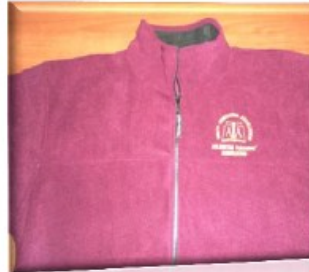
Long-Sleeved Fleece Jacket (front)