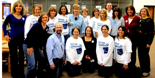
Vail Farm enthusiastically participated in the dress-down day benefitting the March of Dimes.