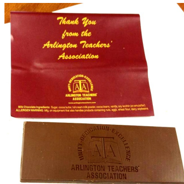
Chocolate bars bearing thank you notes were given out on School Related Professionals Day.