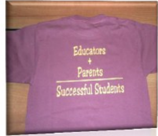
Short-Sleeved T-shirt (back)