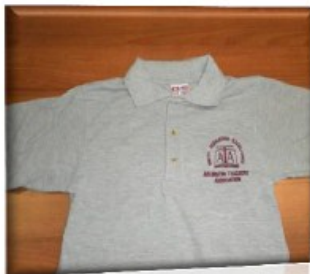
Short-Sleeved Polo (front)